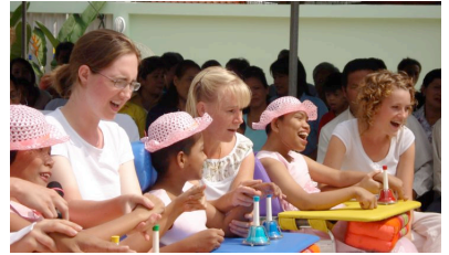
Children from the CCD day-care centres perform a song

The beauty of Lydia's Garden lies not only in its design and natural serenity but also in the way that every aspect demonstrates the care, love and thought that CCD have for the children. All the decisions that have been made and every idea that has been realised, comes from the deep desire to give abandoned disabled children the love, hope and future they deserve.