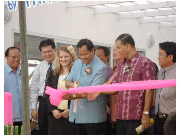
The Governor cuts the ribbon