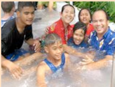
Children and staff enjoy the pool

On the site there is also the beginnings of a vegetable garden , which CCD is very proud of! It is hoped that this will also contribute to the development of the older children as they learn yet more valuable life skills.